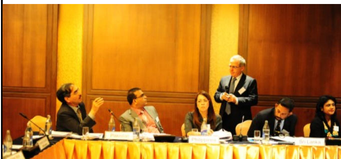
Discussions at the Irregular Movements by Sea Training Workshop, Bangkok

Movements by Sea: International Obligations, Standards and Good Practices was held in Bangkok, Thailand.