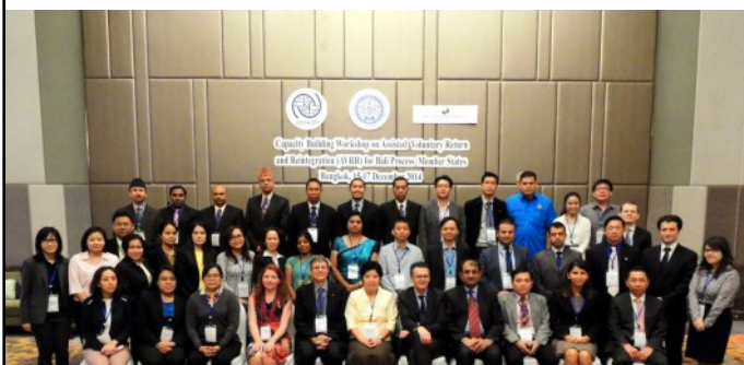
Participants of the AVRR Capacity Building Workshop in Bangkok, Thailand

The policy guides aim to provide a clear and concise overview of applicable international and regional standards for the identification and protection of victims