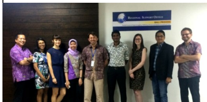
Participants of the Third Meeting of the Policy Guides Drafting Committee